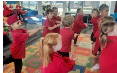
Movement & Fun