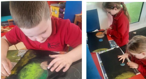
Creative Space Art