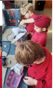
Koala Home Creations

This term, Room 4 has been learning all about kindness. We started with the stories 'The Koala Who Could' and 'The Kind Koala'. These books helped us learn about being kind, brave, and caring. We were inspired to create our own Koala Kindness Tree, where we've been sharing how to show kindness.