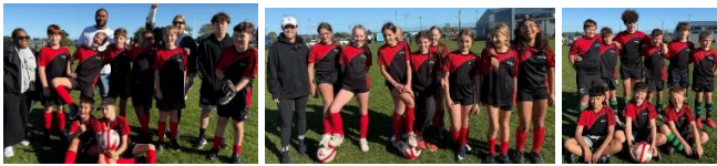
Y7&8 Franklin Football Teams