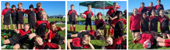
Year 5&6 Franklin Football Teams

~ Outstanding participation & sportsmanship