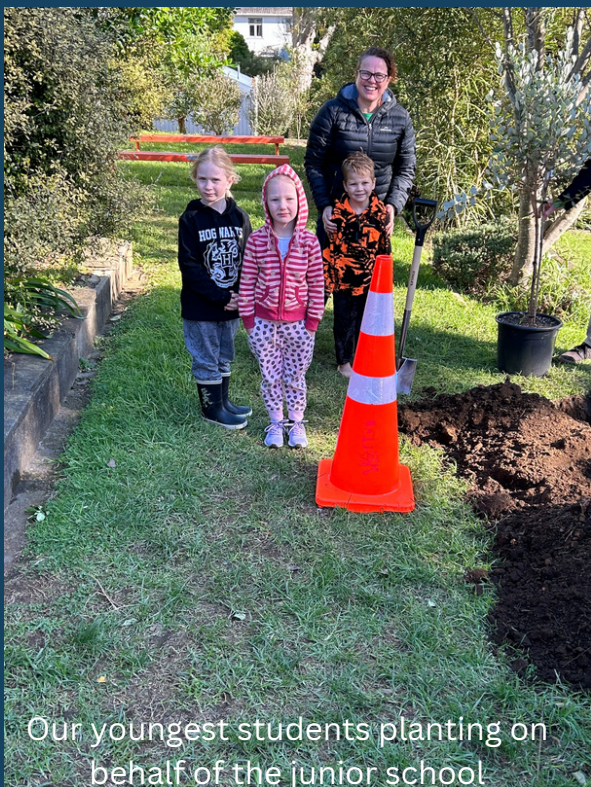
Our youngest students planting on behalf of the junior school

We welcome you to join us for kai at 1 pm on Friday 30 June.