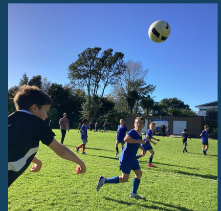
Bell Block Sports Exchange