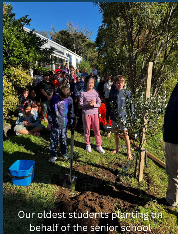
Our oldest students planting on behalf of the senior school