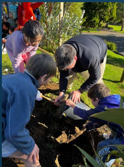
Arbor Day planting

As part of the new strategic plan we will be having more opportunities for whanau to share their thoughts on shaping our school's direction.