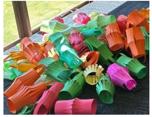
Students actively participate in making decorations and putting them up around the school, enriching the spirit of Ramadan