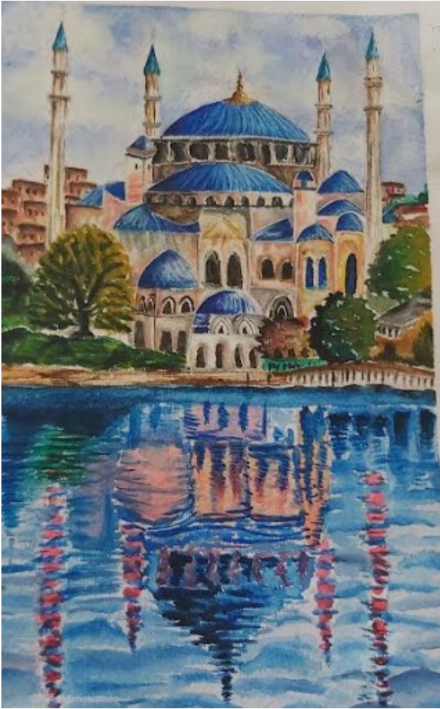
WATER COLOUR BY ZAYNUB CHIDA, year 10