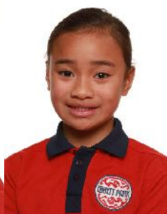
Vallerissa Room 3