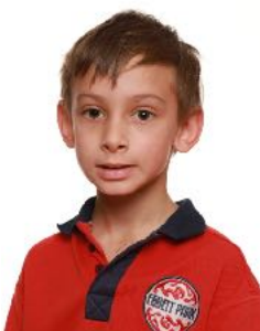
Kaianaki Room 2

These students earned the most Classdojo points in their classroom during the week.