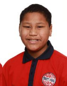
Waratah Room 6