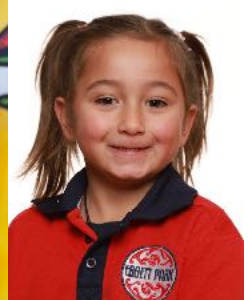
Emerald Room 9