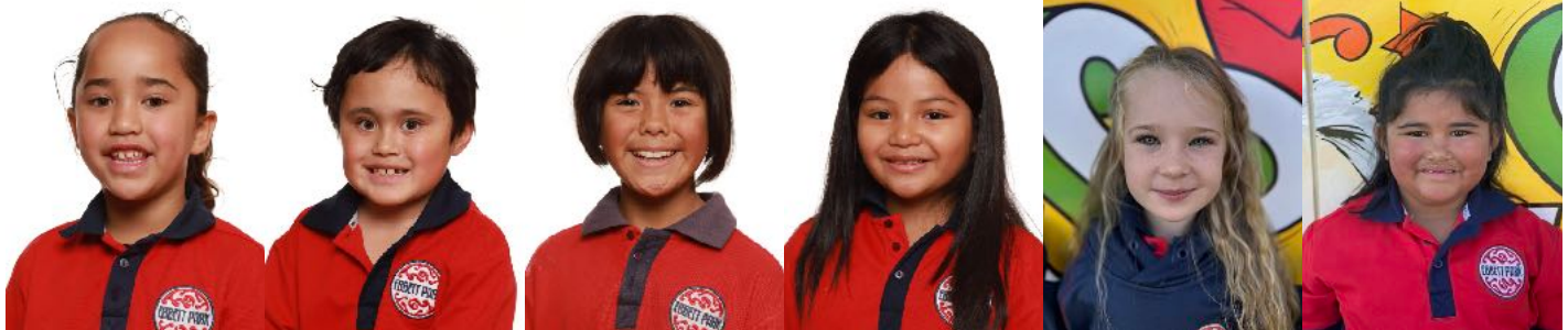
Cassy Room 2

These students earned the most Classdojo points in their classroom during the week.