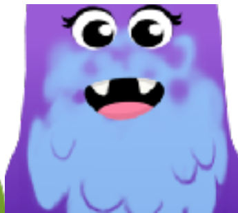
Week Eight Tangaroa