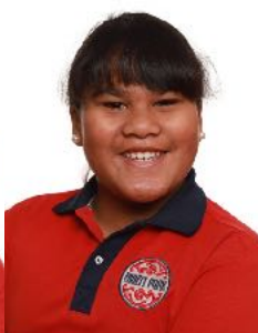
Kyexar Room 6