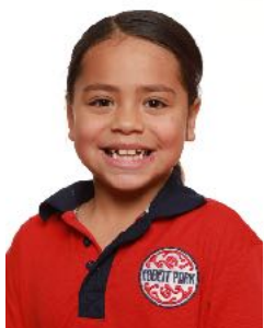
Lucia Room 2

These students earned the most Classdojo points in their classroom during the week.