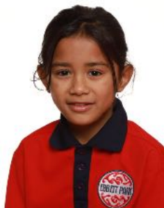
Dynesty Room 3