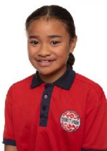
Vallarissa Room 3 92 points