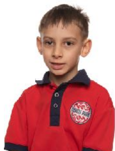
Kaianaki Room 2 73 points

These students earned the most Classdojo points in their classroom during the week.