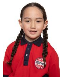
Harmony-Rose Room 7 40 points Hadlee-Grace Room 9 40 points