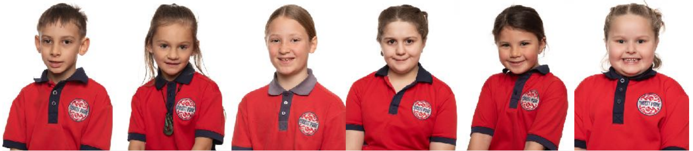
Kaianaki Room 2

These students earned the most Classdojo points in their classroom during the week.