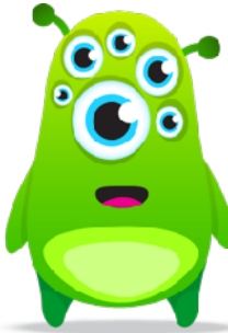
Week Six Tane Mahuta