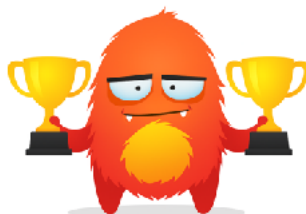
Term 3 Winner Rongomatane