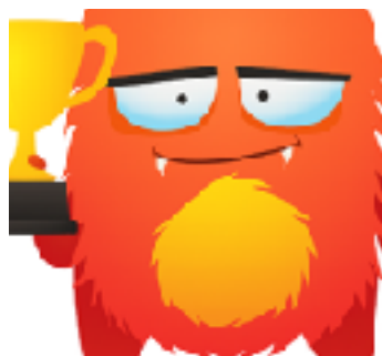
Term 2 Winner Rongomatane