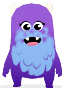
Week Two Tawhirimatea