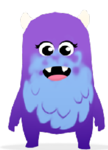
Week Eight Tahwirimatea