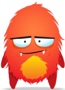
Week One Rongomatane