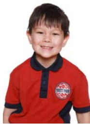
Sali Room 6