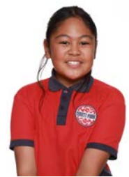
Harlem Room 8