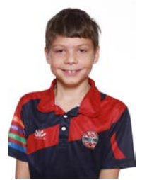
Sivarna-Eve Room 9