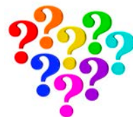
Term Three Winner