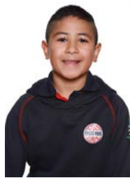
Aria-Rose Room 5