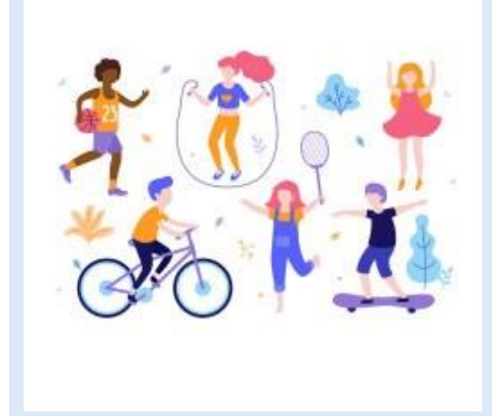
Have a wonderful holiday!

We would love to hear from you on your child's sporting achievements inside and outside of school. Please email me pictures and information so we can publish here.