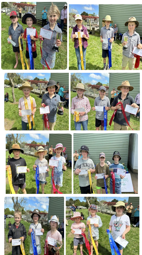
Our 2023 Pet Day Cup Winners!

What a brilliant success our 2023 Pet Day was, a very big THANK YOU to our Judges, BOT, Home and School Committee, parents, children and pets for making this such a great day. We are amazed at the turnout this year and every pet looked it's hard-worked at best. Congratulations to all the winners and to everyone who entered, you all did a magnificent job!