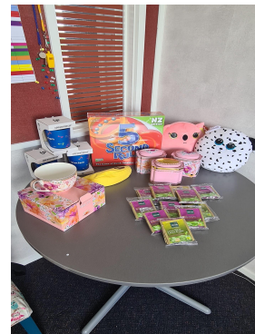
Prizes from Jumpjam for StarJam

Last term we took part in the Jump Jam 4 Starjam fundraiser with the money going towards the Starjam Charity - this is a movement for people with special needs to take part in a weekly programme of singing, dancing and socialising. We raised $300 and in doing so won first place for raising the most $ per student in the country! Great effort everyone, it was a fun day and we look forward to taking part again in 2024!