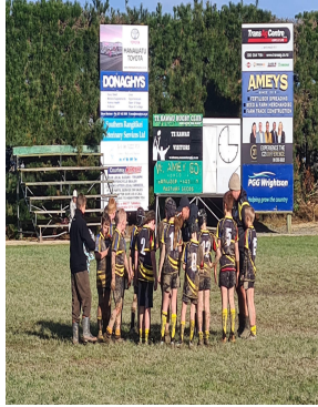
A solid effort by the under 12's with a convincing win over Te Kawa