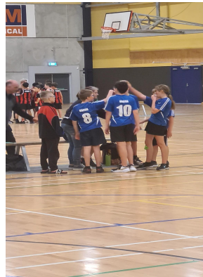
Oroua Basketballers Jammin at the Arena winning against College Street School

Oroua Netball - Scores for this week Oroua Blue won 15-4 and Oroua White won 17 - 5