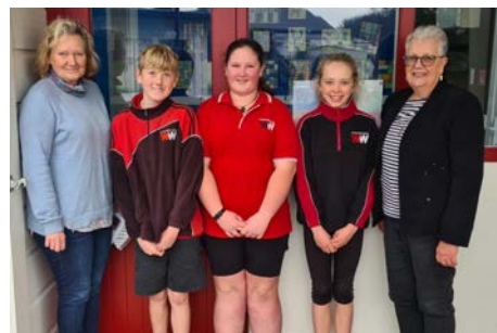
Year 8 Overall Winners