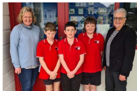
Year 7 Overall Winners