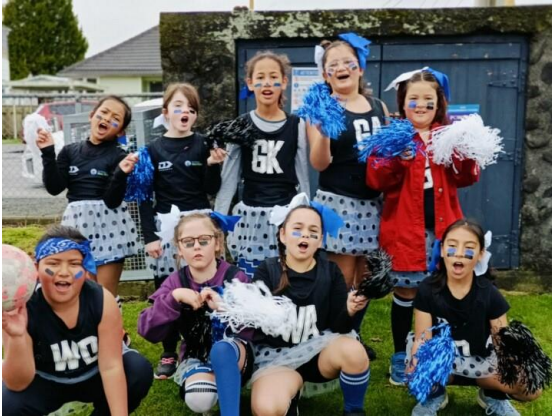
Our year 4 netball group Hau Karetu Kotahitanga