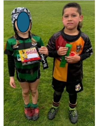
Reeco player of the day

Taki Rua: Taki Rua are coming to perform for us this Friday 23 rd August in the hall at 1.30pm. There is no cost to students for this performance. If parents wish to attend, we would appreciate it if you would please pay a gold coin or koha. This performance is targeted at ages 5-12 years. No pre-schoolers. Thank you.