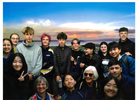
Gondola and Luge