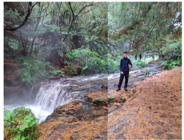
Soaking in the hot water and standing under the waterfall, surrounded by native bush, was a special treat at Kerosene Creek