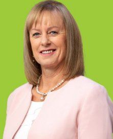
Barbara Kuriger National MP Taranaki - King Country