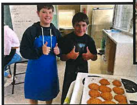
The Kauri Pod Team