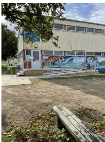
Entrance to main reception/admin block