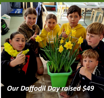
Our Daffodil Day raised $49