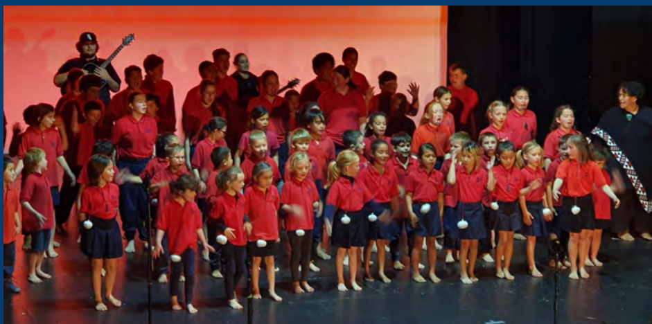
Our tamariki on stage at the Kapa Haka Festival held in the Dannevirke Town hall last Thursday and below .....