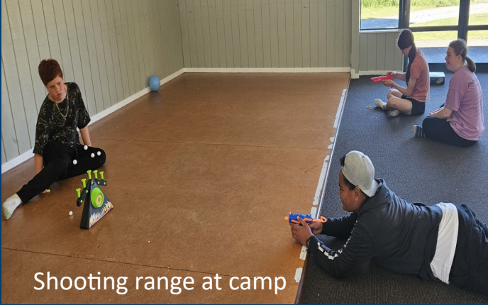
Shooting range at camp