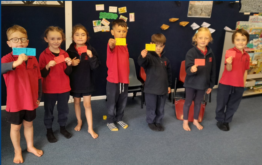
This week's GREAT card winners