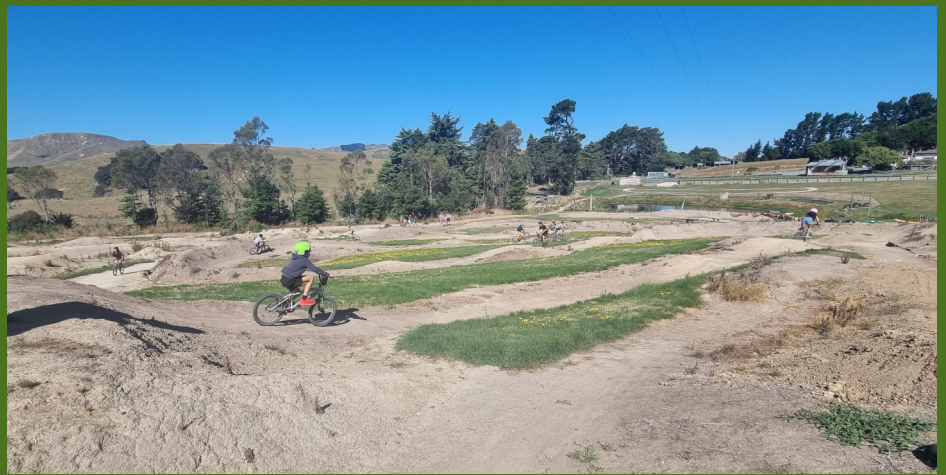
More shots from our senior leadership camp last week