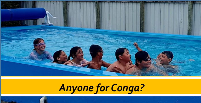
Anyone for Conga?