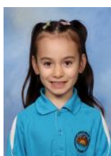
Waipunarangi Winter Eagle