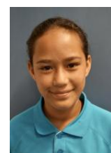
Wai Toiora Te Aroha Wipaki