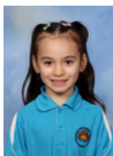
Winter Eagle Waipunarangi