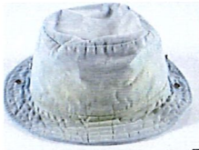
_ 2 Fred Dag Hats