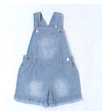
Girls size 10-12

We are currently looking around for specific pieces of clothing for our tamariki to wear on stage. We have included a list of items. If you could help with this, it would be much appreciated.