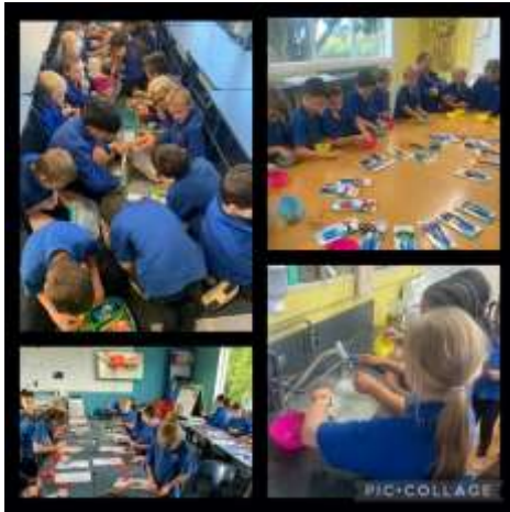
ANZAC day activities in Room 4