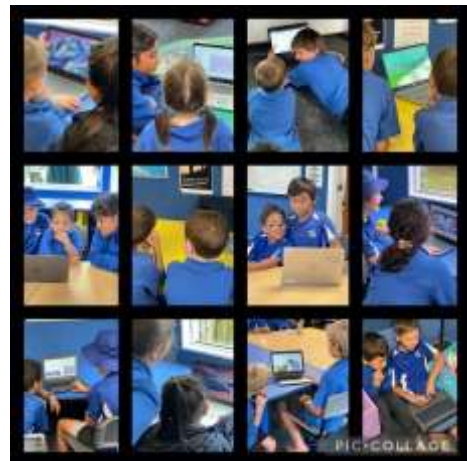
Room 2 sharing their digital books