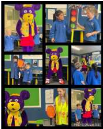
Ruben the road safety bear with R5 and R6