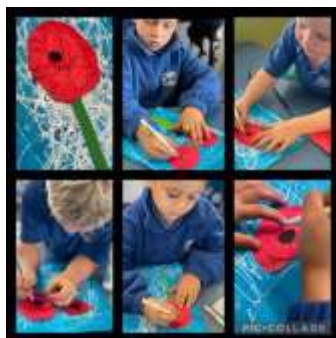
Anzac poppy art