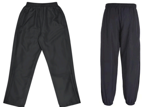
Images of approved school track pants above

Also a reminder that footwear in winter is plain black shoes (any brand) with no white soles and black socks that have no visible colour or labels when the shoes are being worn.