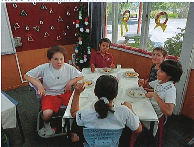
Ready for the next stage after the first dish. Pudding is next... Spoilt for choice with kabab fruits and a whole lot of other treats. Thank you to all the kaiako putting on kai for their classes.

Maniapototanga – versed in the whakapapa, waiata, karakia, histories of Maniapoto