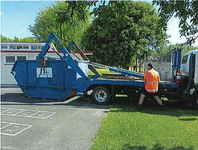
Clean up time at the kura... A large skip was recently dropped off so we can finally get rid of all the unwanted 'stuff' that had been stored for ages. A good clean out was overdue through all the resource areas.