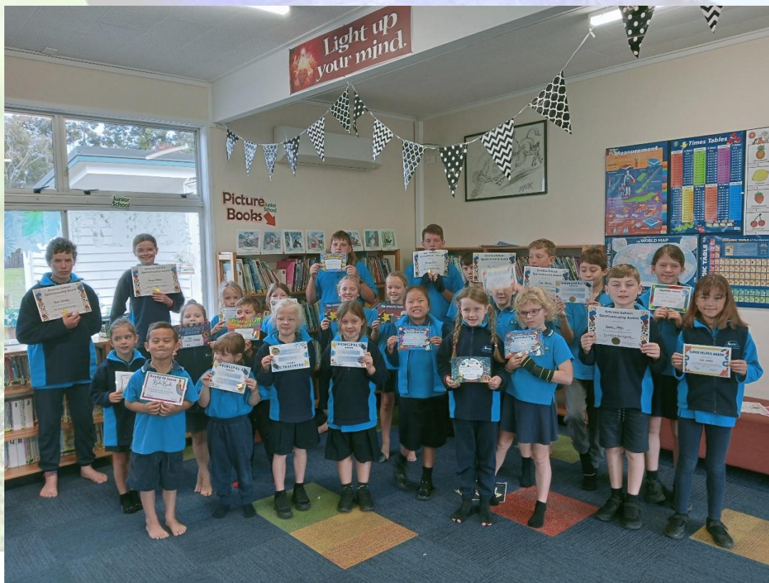
CLASS AND PRINCIPAL AWARDS - WEEK 4