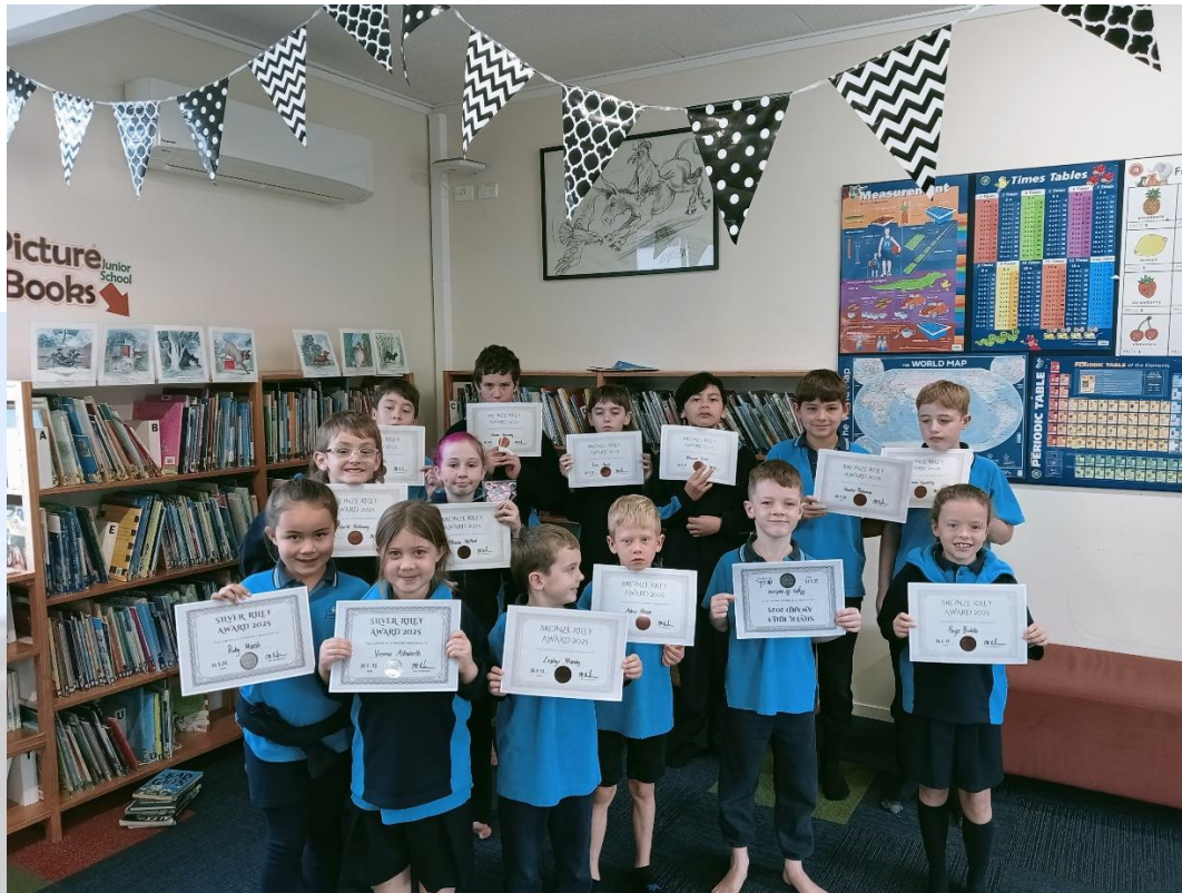
RILEY AWARD WINNERS – Week 4