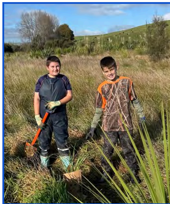
Tree Planting at Treder's Farm