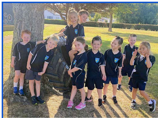
Some of our Sr Alphonsus students enjoying the sunshine.