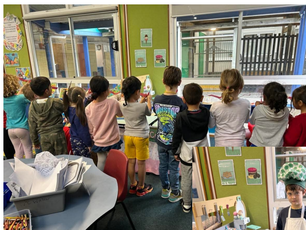
Room 5 cutting the ribbon for the grand opening of their new play Cafe

The school pool is now closed and we need all keys to be returned asap. You will also receive your key bond back. Please bring your pool key back to the school office.