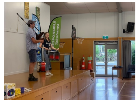
The Pipe Band performing in assembly.