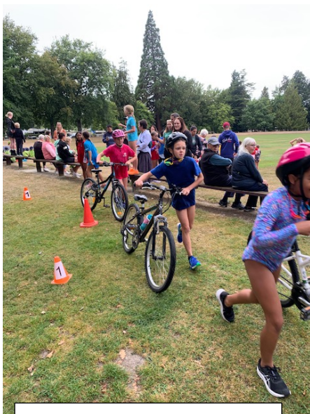
Coming into the bike transition.