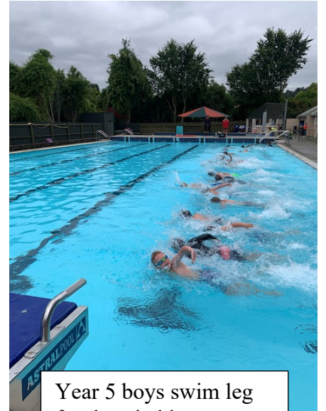
Year 5 boys swim leg for the triathlon.