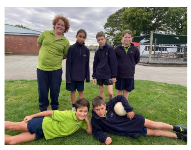
Year 3 / 4 Futsal team