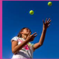
Learn to Juggle Workshop