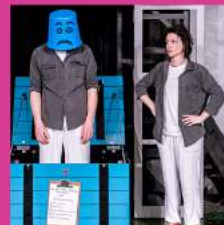
The Messy Magic Adventure - Rollicking Entertainment Family