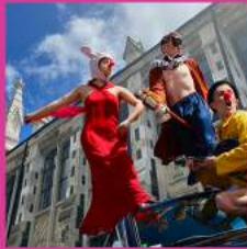
Off Centre Kick Off Parade Family Show

Celebrating The Arts Centre's restoration