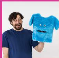
Tusk Puppets - The Lost Sock Family