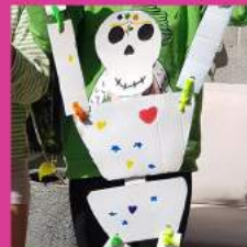
Fiesta Marionette Workshop