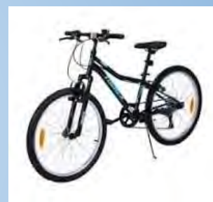
Tourex 60cm 6 Speed Bike