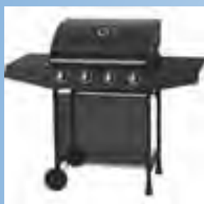
Meteor 4 Burner BBQ

Prize Draw entries may be purchased on KINDO , Cash at the school office before 9am 28th March or using Gala tickets on the night of the gala.