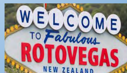
Rotorua Family Adventure Pack