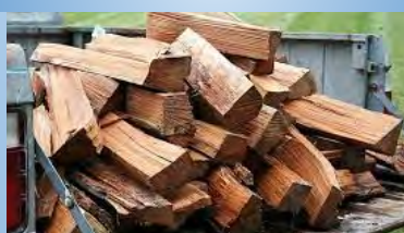
Jumbo Bin of Kiln dried Firewood