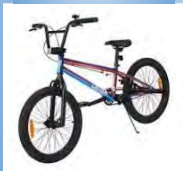
Neochrome 50cm BMX Bike