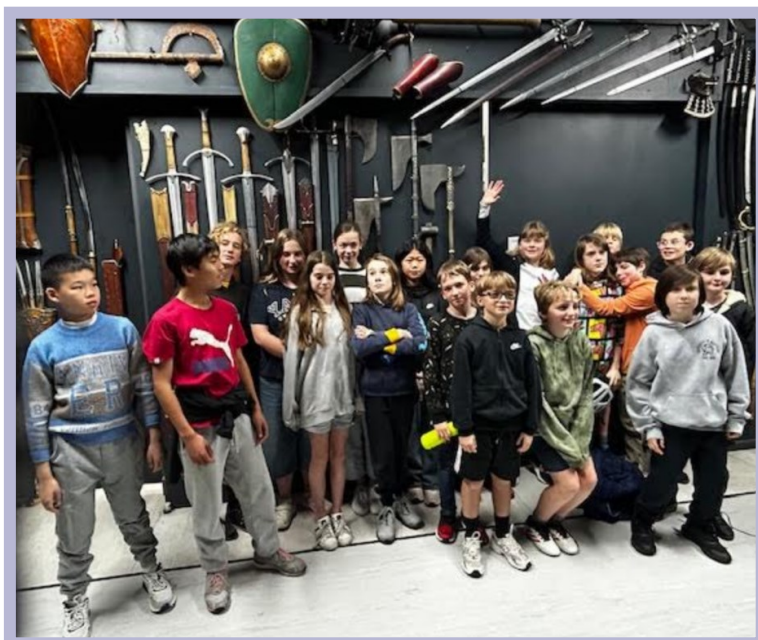
Upper Bridge getting into character