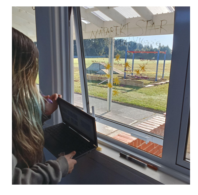
Great work all round!