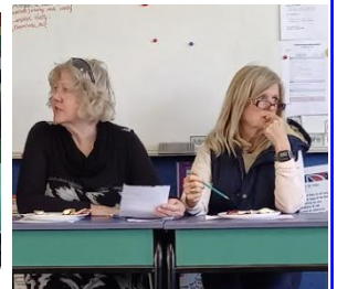
Science work by Room 1