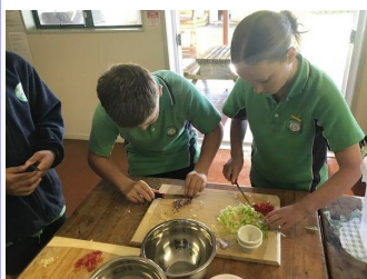
T E C H N O L O G Y

Two classrooms at CHB College are due to be fitted out to become a temporary site until a new purpose-built centre is built, sometime in the future??