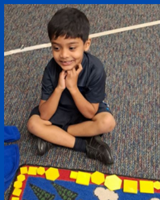
Pattern learning in Ruma Iti