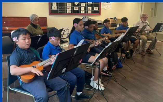
Ukulele Performance Kenepuru Summerset Retirement Village