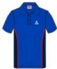
SHORT SLEEVE POLO