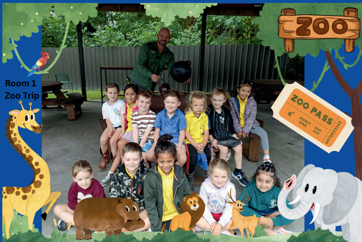
Room 1 Zoo Trip