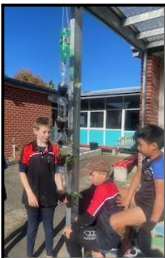
Today we created planters for our strawberries. This group of boys were able to finish theirs. Hopefully we will have plenty of strawberries to eat in the summer. - Mrs Hellewell