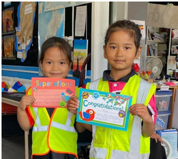
Jazzie for becoming more confident to ask for help; Priya for developing great oral language.