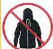
Fleece Zip Hoodies

The following items are NOT acceptable at school: