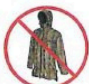
Bush Wear Items