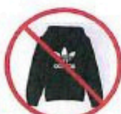
Hoodies / Jerseys